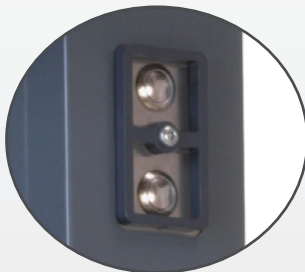
Easy to operate control panel