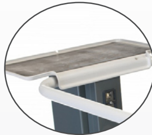
Material tray on top of the lift